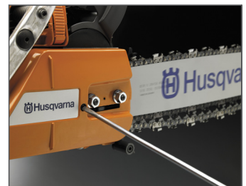
SIDE-MOUNTED CHAIN TENSIONER Easier access to chain tensioning device.