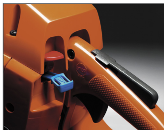
COMBINED CHOKE/STOP CONTROL Allows for easier starting and reduces the risk of engine flooding.