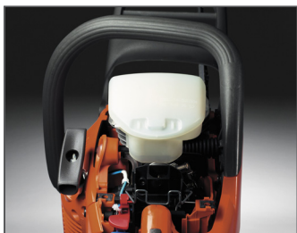
QUICK-RELEASE AIR FILTER Facilitates cleaning and replacement of the air filter.

The 455 Rancher is an ideal saw for landowners and part-time users who require a high powered, heavy-duty and responsive workmate for all cutting conditions. It combines the best characteristics of its predecessor with new, facilitating technology and ergonomics.