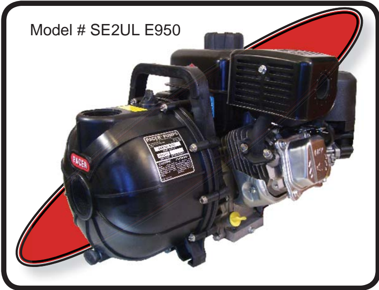
Model # SE2UL E950