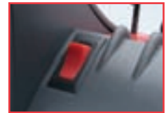
Blower Fan On/Off Switch