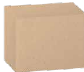
Double-corrugated drop-ship packaging.