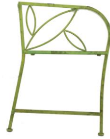
(C) * 1