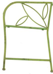
(B) * 1