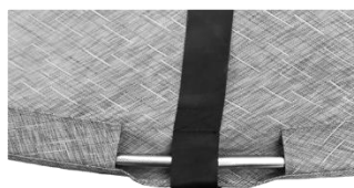
CORRECT UNDERSIDE VIEW