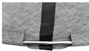
INCORRECT UNDERSIDE VIEW

Step 1: Place your hanging chair upside down flat on the ground, there you will find the belt loops where you will insert the steel tubes