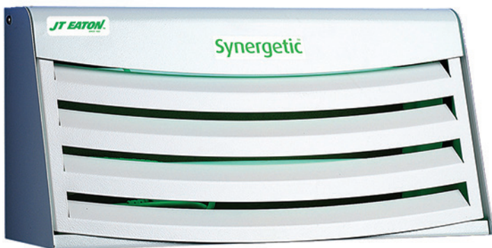
Model No. 1500LV - Includes Two Non-Shatterproof Bulbs And One Glue Board

Power 38 WATTS Dimensions 22" W x 12 1/2" H x 6 3/4" D Coverage (ft 2 ) 850 Weight 13 lb.