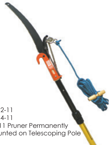
TP-12-11 TP-14-11 PH-11 Pruner Permanently Mounted on Telescoping Pole

For safety, Jameson does not recommend attaching additional poles or Big Shot to Telescoping Poles.