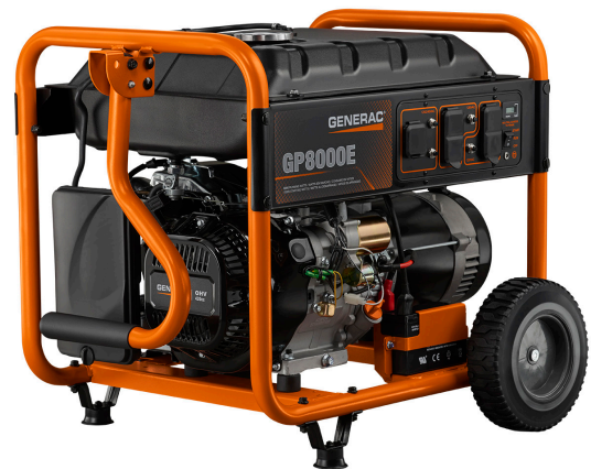
Photograph may not represent actual content.

Model 6954-0 UPC: 696471069549 (49ST/CSA)