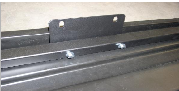
FIG. 4 (INSIDE MOUNT)

**NOTE**MOUNTING PLATES CAN BE MOUNTED TO THE INSIDE SEE FIG. 4 OR OUTSIDE SEE FIG. 4A OF THE CANOPY FRAME TO ACCOMMODATE YOUR ROLLBAR WIDTH. **