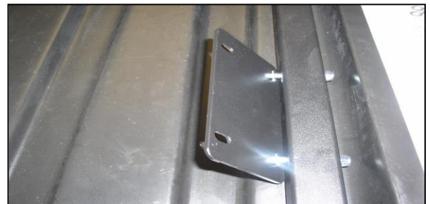
FIG. 4A (OUTSIDE MOUNT)