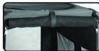
Door Open and Secured