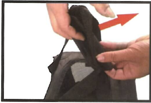
Disconnect soft side handles