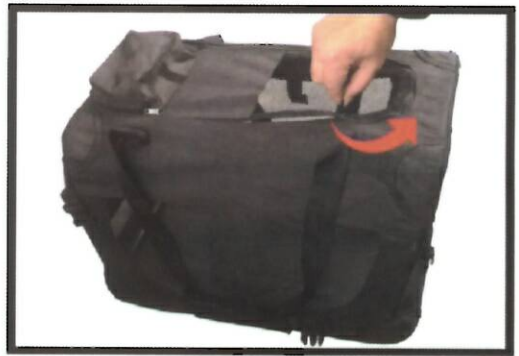
Unzip top of carrier