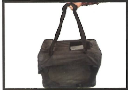
Pet carrier is ready to transport your pet