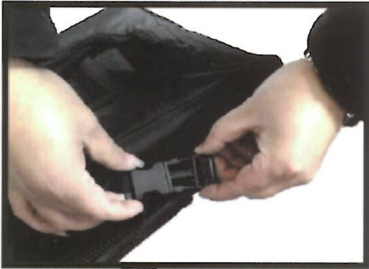
Lock side brackets