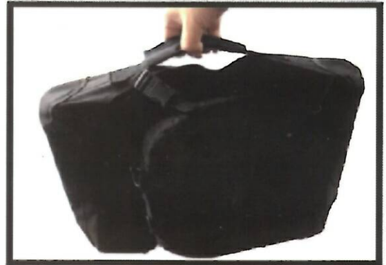
The pet carrier is ready to store