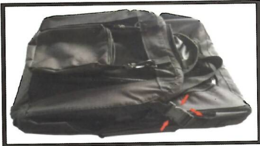
Unlock side brackets