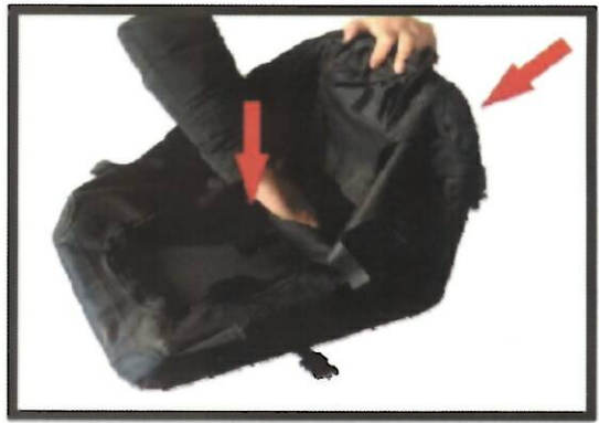
Fold down carrier so that outer bag is facing out