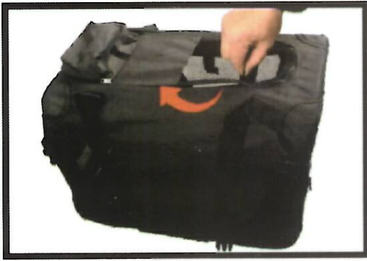
Zip top of carrier to enclose