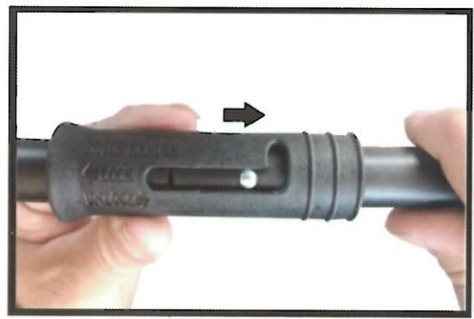
Disconnect side rods-Left