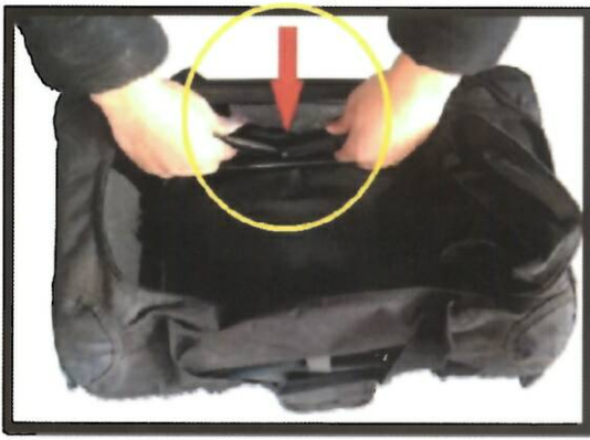
Fold rods to side of carrier