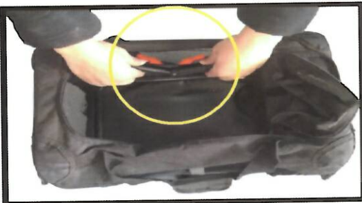
Assemble spring loaded side rods