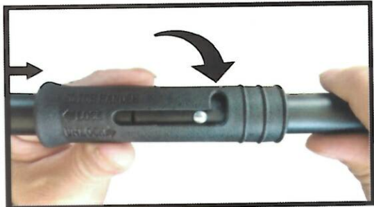
Slide cover over rod into locking position