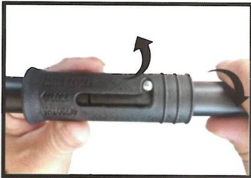
Disconnect side rods-Right