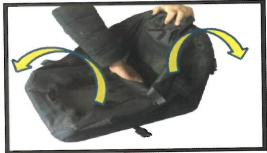
Open sides of pet carrier