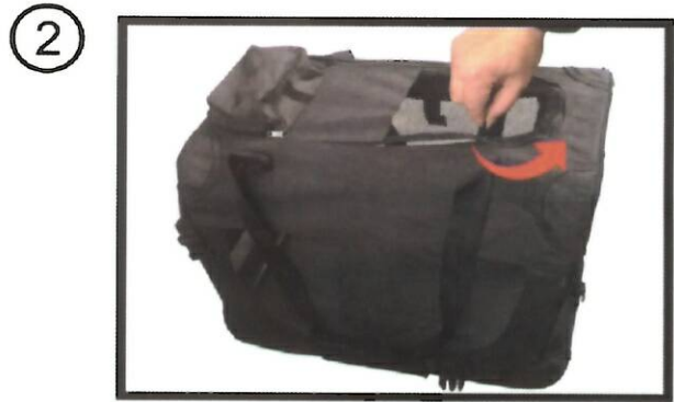
Unzip top of carrier