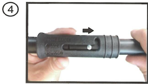
Disconnect side rods-Left