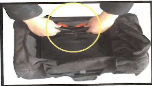
Assemble spring loaded side rods