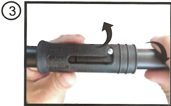
Disconnect side rods-Right