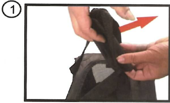
Disconnect soft side handles