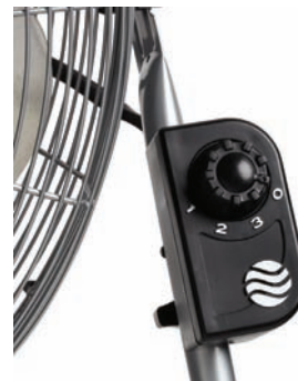
Front Mounted Control for Added Convenience