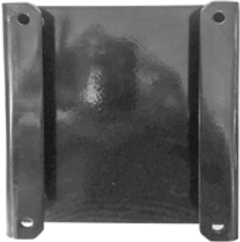
1 piece 7 x 8 inch dolly