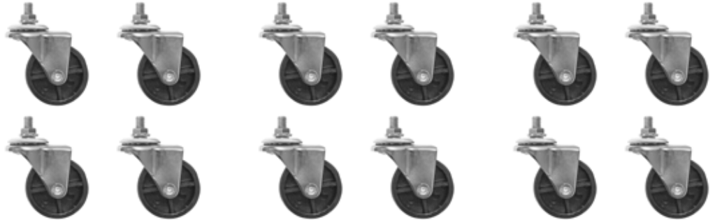
12 pieces total swivel casters