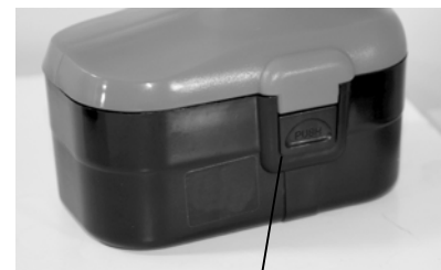
Battery (Press Lever on both sides to Remove) Figure 3