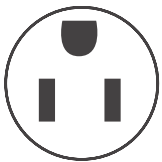
Plug Type (NEMA) 5-15P

1 Warranty 5 year sealed system/1 year full parts and labor.