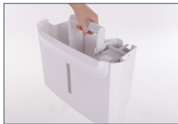
Ergonomic Water Tank Handle