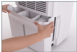
Detachable Water Tank