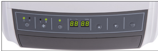
Digital Control Panel