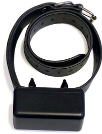
Rechargeable Receiver Collar