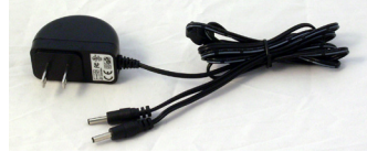
ET-1 Dual Charger

(The charger has two plugs, one to charge the collar and one to charge the transmitter.)