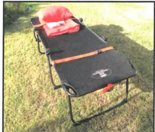
2. Unfold and position tension straps to inner legs. tighten straps