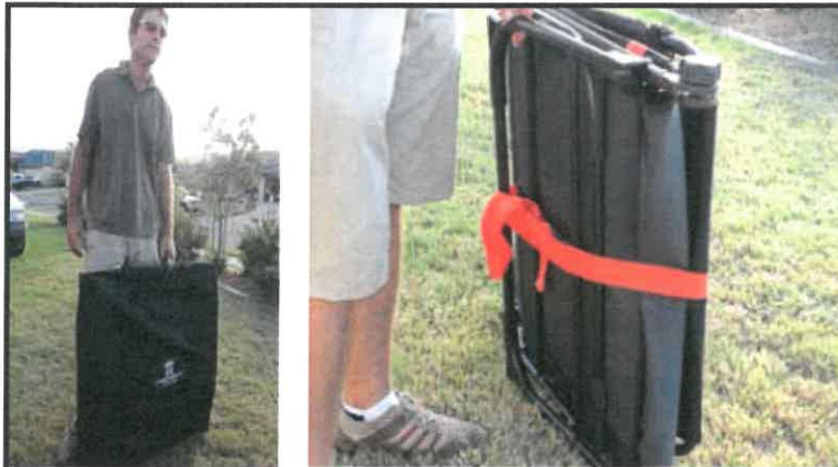
1. Remove the ETC from its Carry bag

Thank you for purchasing the Kamp-Rite Emergency Treatment Cot We trust this product will fulfil your absolute requirements in any situation where it is intended for use. Please keep this instruction sheet in a safe place for future setup reference.