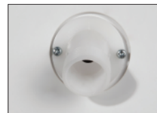
Direct to Drain