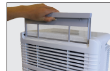
Easy Access Washable Filter