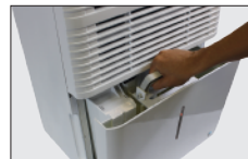
Easy Access Bucket with Carrying Handle