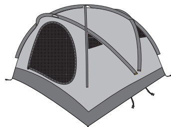
[1] Inner Tent / Main Body