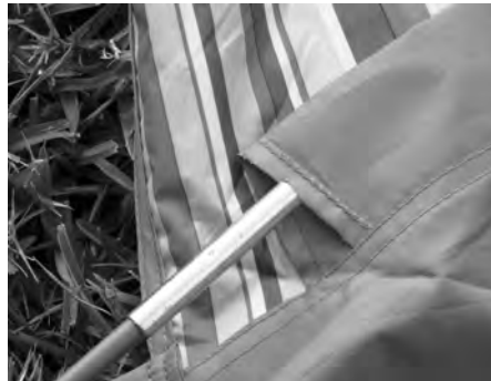
Step 2 - Assemble 1 short pole and push it through the roof sleeve, ferrule side first. Repeat this step for the remaining short pole. DO NOT insert the pin into the pole.