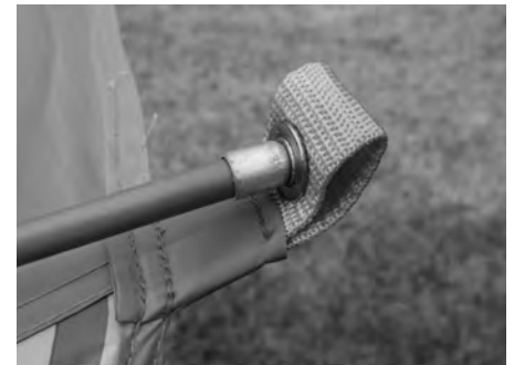
Step 6 - Insert the pole's pin into the grommeted web strap above the front opening of the cabana.