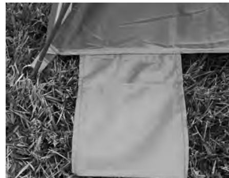
Step 9 - Add weight (sand) in the bags to secure your cabana in high winds.