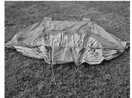
Step 3 - Assemble the long pole and push it up through the sleeve from one side, over the two roof poles, down to side of the cabana skin.