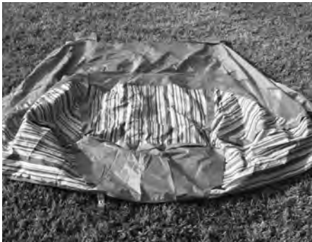
Step 1 - Spread the cabana skin.