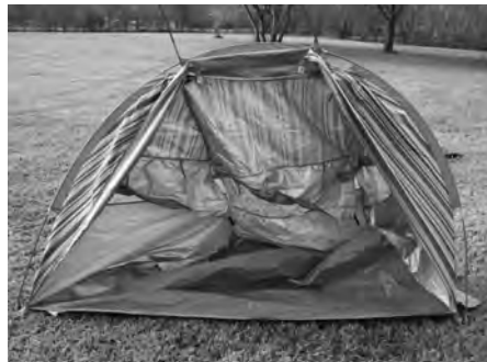
Step 5 - Insert the pin and ring into the ferrule of the short rear roof poles.