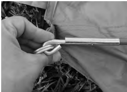
Step 4 - Insert the pin and ring into the ferrule end of the long side pole. Do this on both ends.