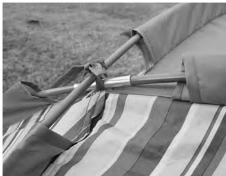
Step 7 - Secure all poles with ties on the roof skin as shown above.