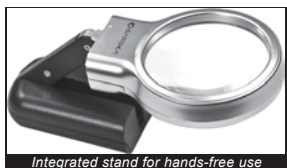
Integrated stand for hands-free use