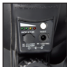
Battery Capacity Indicator AC/DC plug for charging on left DC plug for lighting on right