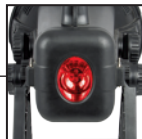
Emergency beacon LED