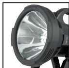
Ultra-bright 55W HID up to 3,500 Lumens