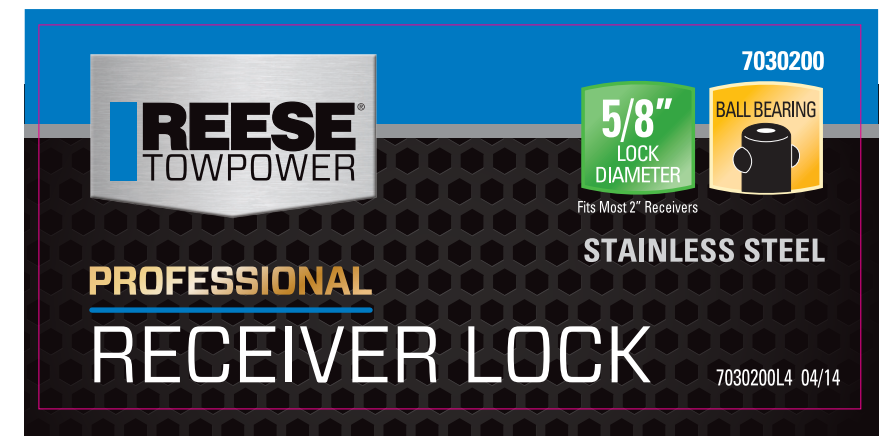
TRAY LABEL Permanent Adhesive Laminated