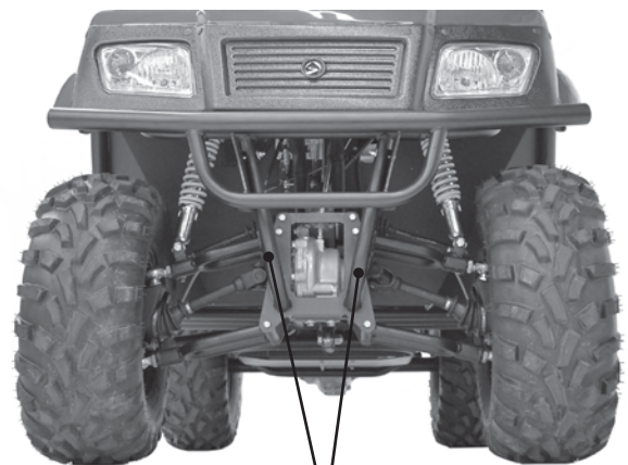
vertical front frame rails