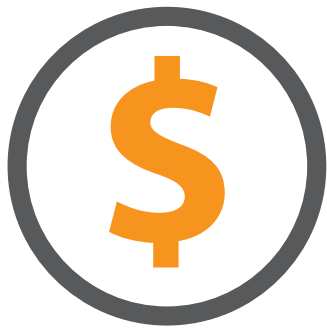
PelPro PP130 and PP60: Best-in-Class Fuel Economy

PelPro pellet stoves are a great alternative heat source that is economical, low-maintenance and beautifully crafted. Heat is generated from wood pellet fuel, a renewable resource made entirely from lumber production waste. This waste (sawdust) is dried, cleaned, heated and compressed into uniform pellet pieces the size of a pencil eraser.