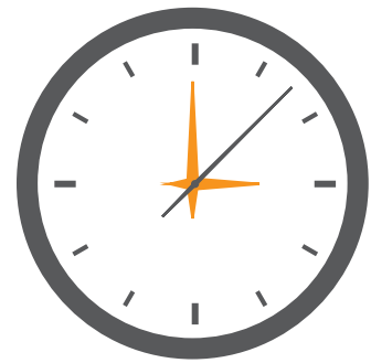
Spend less time filling and maintaining with large hoppers