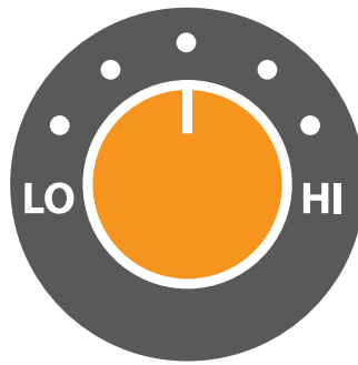
Easy to use dial control