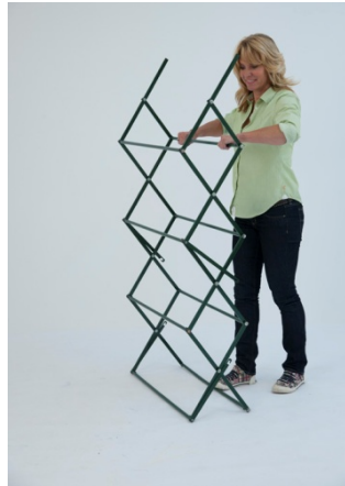
2. Lock shelves into place using locking mechanisms on each side