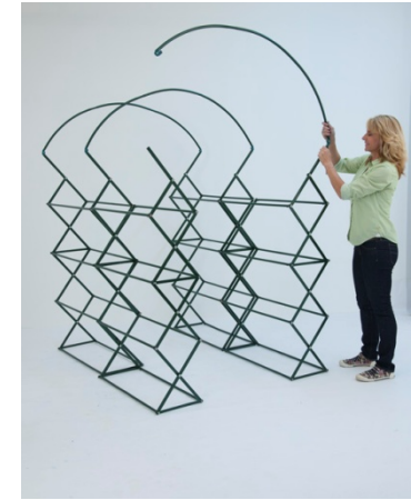
4. Connect top bow pole (marked "A" 6pcs, "B" 2pcs, "C" 1pc) to each section of shelving