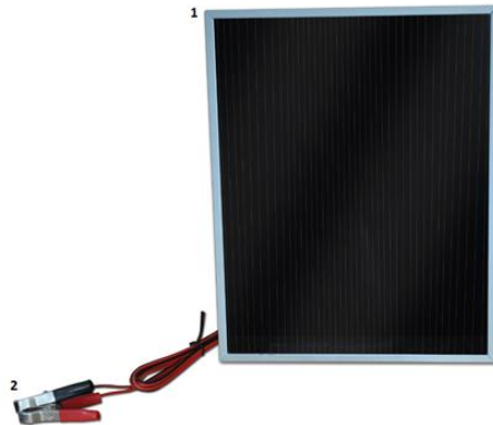
Diagram and Parts List