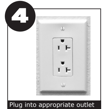
Plug into appropriate outlet

5 For setup, KUUL Comfort™ evaporative media should appear wet before starting the fan. Check the water gauge to monitor water level in tank. The water adjustment valve on each portable evaporative cooler is set at max flow. However, ensure the knob is turned completely to the right before use. Turn to the left to increase water flow. If entrainment occurs - water is spitting from the front of the product - use the valve to decrease the water flow until entrainment ceases.