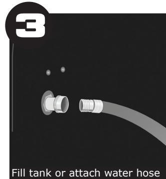
Fill tank or attach water hose