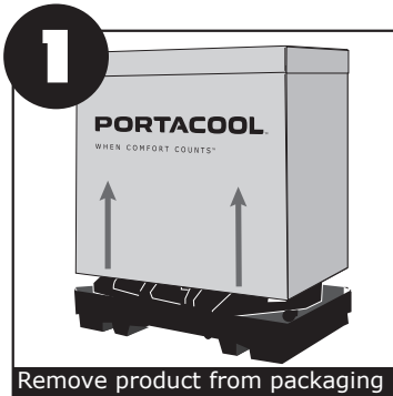
Remove product from packaging