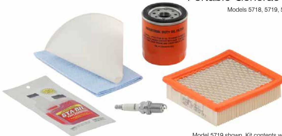
Model 5719 shown. Kit contents will vary by model.