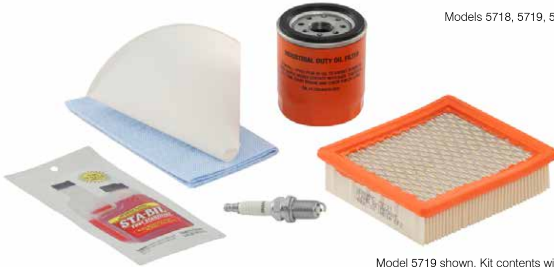
Model 5719 shown. Kit contents will vary by model.