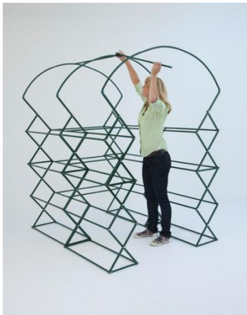
5. Install roof pole (marked "D" for full set roof, "E" for half set roof) across both sections of bows