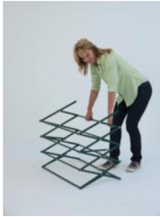
1. Extend X-Up shelving