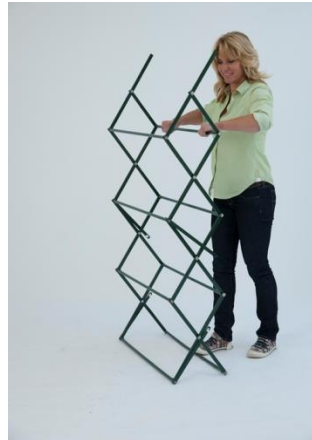
2. Lock shelves into place using locking mechanisms on each side