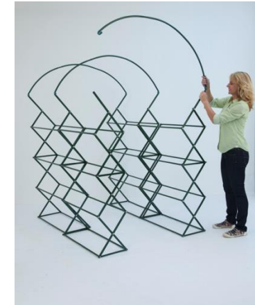
4. Connect top bow pole (marked "A" 6pcs, "B" 2pcs, "C" 1pc) to each section of shelving