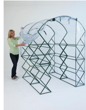
7. Place cover over shelving assembled shelving unit