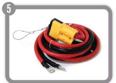
6 ft. Battery Lead