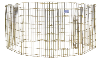
Gold Zinc with Door

Sturdy Framed Door Allows for Convenient Step-Through Access