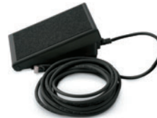
RFCS-RJ45 #245589 Remote foot control.