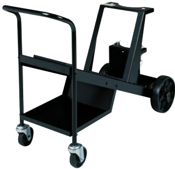
Running Gear/Cylinder Rack #770187 Heavy-duty construction. Accommodates large and small gas cylinders.