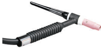
Weldcraft® Legacy™ 17 Replacement TIG Torch 1712RESYLGC #245271 12.5 ft. (3.8 m) TIG torch with backcap, ceramic gas cup, 3/32 in. (2.4 mm), collet and collet body, and 2% ceriated tungsten.