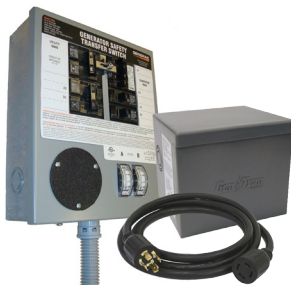
30 AMP Pre-wired Model 6294

30 AMP and 50 AMP KITS For Portable Generators