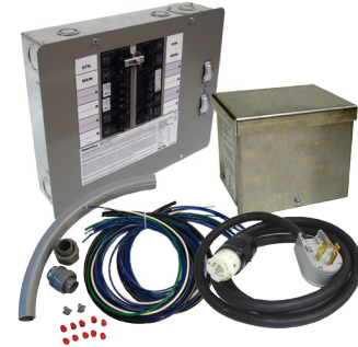
50 AMP Model 6296